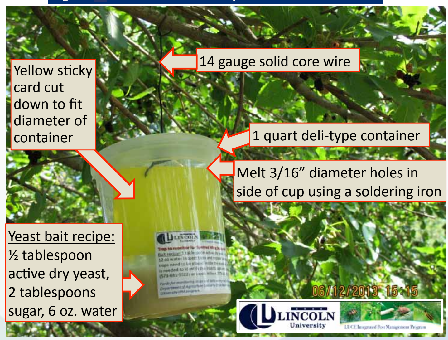
Figure 3. How to make a trap to monitor for SWD

If you are interested in monitoring for this pest and need materials at no cost, please contact Dr. Jaime Piñero at PineroJ@LincolnU.edu or (573) 681-5522.