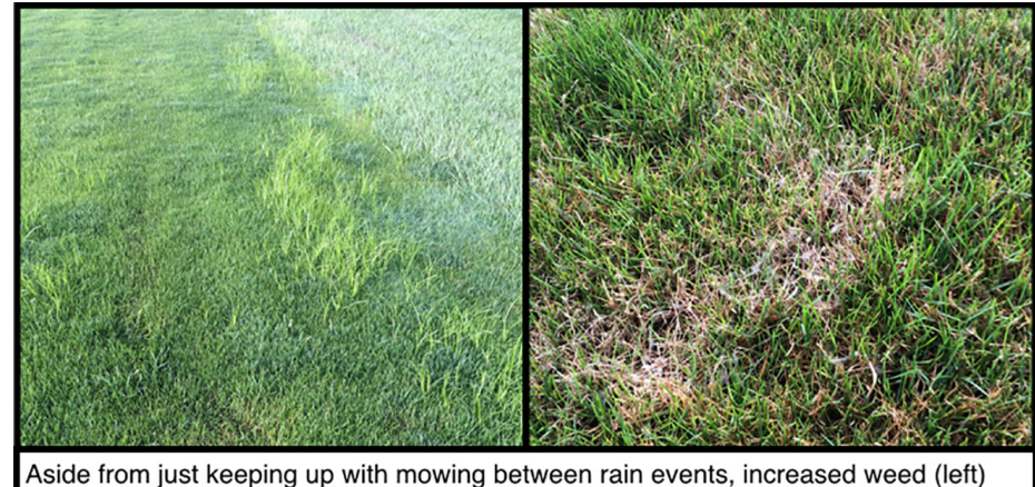
Aside from just keeping up with mowing between rain events, increased weed (left) and disease (right) pressure has resulted from the wet weather in May - July 2015.