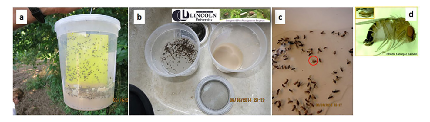
The process of identifying SWD: (a) view of trap with many small insects on the sticky card and in the sugar/yeast bait; (b) view of container with insects floating on clean water after sieving them from the old bait(on the right); (c) after spreading out insects onto a tray, use a paint brush or similar to split them into smaller groups, and then systematically look for small flies that have either spots on wings (male SWD, see red circle) or flies that have the egg-laying structure (shown enlarged in [d]).

The first adult Spotted Wing Drosophila was captured by a monitoring trap in the Jefferson City area on May 27th, 2015. This trap was hung from a mulberry tree that has ripening fruit. Since then, SWD has been found in most locations where SWD monitoring traps have been setup by the LU / MU IPM programs. Consequently, farmers are encouraged to monitor for this insect pest Ideally, monitoring traps should be deployed starting 3-4 weeks before berry ripening and throughout the harvest season. Place one monitoring trap baited with active dry yeast (1/2 tablespoon), sugar (2 tablespoons) and water (6 ounces) per acre. The trap needs to be hang on a plant, stake, or trellis 3–5 feet above the ground on the most shaded / cooler side of the plant canopy. Because SWD reproduces so quickly under warm weather conditions, the first SWD trapping data are vital to activate pest management programs to prevent rapid population increases and potential infestations on a farm.