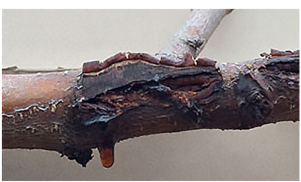
way to guard against spread of caused by an infection of Leucostoma fungi on a peach branch.

tree health with cultural practices. Careful attention to tree nutrition, especially preventing nitrogen and potassium deficiencies, will help keep trees healthy. Submitting leaf samples for foliar analysis from July 15 to August 1 will help determine the tree nutrient status and the amount of fertilizer needed to maintain productive fruit trees. Late winter pruning is also recommended to prevent premature deacclimation of trees. If possible, wait until just before buds begin to grow to prune. When pruning, avoid horizontal or flat cuts where water can collect and prolong infection periods. Also, prune healthy trees first and leave the infected ones until last to avoid spreading the disease. When pruning infected trees, disinfect the blades of the pruning tool between cuts. Household bleach (1 part bleach + 3 parts water), Pine-Sol cleaner (1 part cleaner + 3 parts water), or rubbing alcohol (1 part 70% isopropyl alcohol + 1 part water)