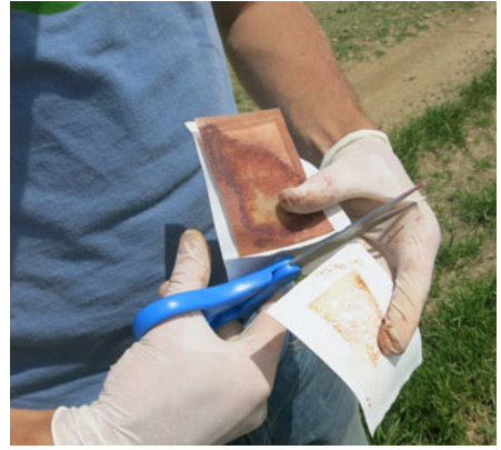
A. Protective wings of the AgBio lure being removed - to aid in scent dispersion.

Funding for trap cropping research was provided by the Ceres Trust: An Organic Initiative (http://cerestrust.org/), and by the USDA/National Institute of Food and Agriculture (NIFA) Capacity Building Award No. 2011-38821-30867. Funding for mass trapping research was provided by the North Central Region IPM Center through Sub-Award # 2007-04967-35 and by the USDA/NIFA Capacity Building Grant program, Award No. 2011-38821-30867.