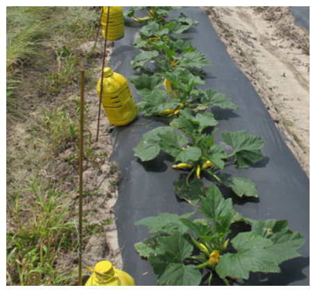
C. Trap deployment in a zucchini field (Lee Farms, Truxton, MO).