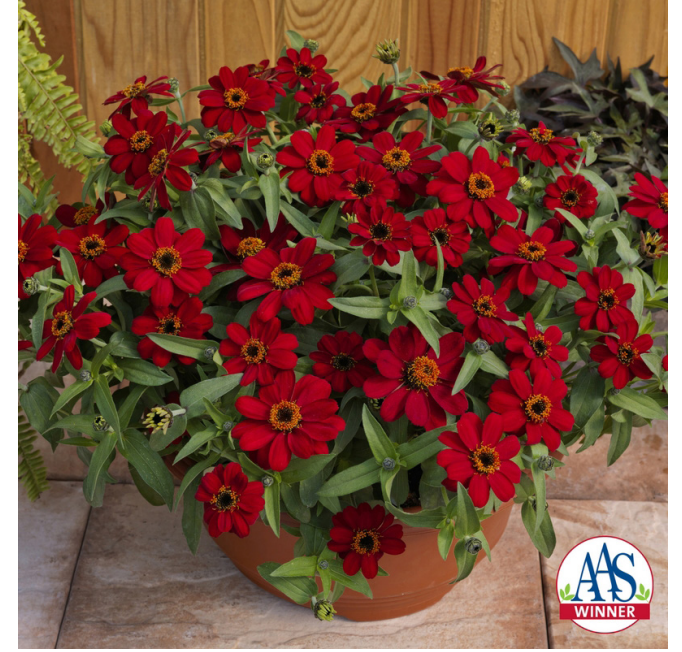
Zinnia 'Profusion Red'

Dahlia 'Magic Sunrise' (Dahlia pinnata). 'Magic Sunrise' is a bright, flamingo-pink dahlia with a glowing yellow center. The sturdy, 3-4 foot plants produce a non-stop supply of big, 6-inch flowers, ensuring months of beautiful bouquets. 'Magic Sunrise' is a great choice for planting at the back of a perennial border, because the colors work so well with other late summer flowers such as purple coneflower, sedum and phlox.