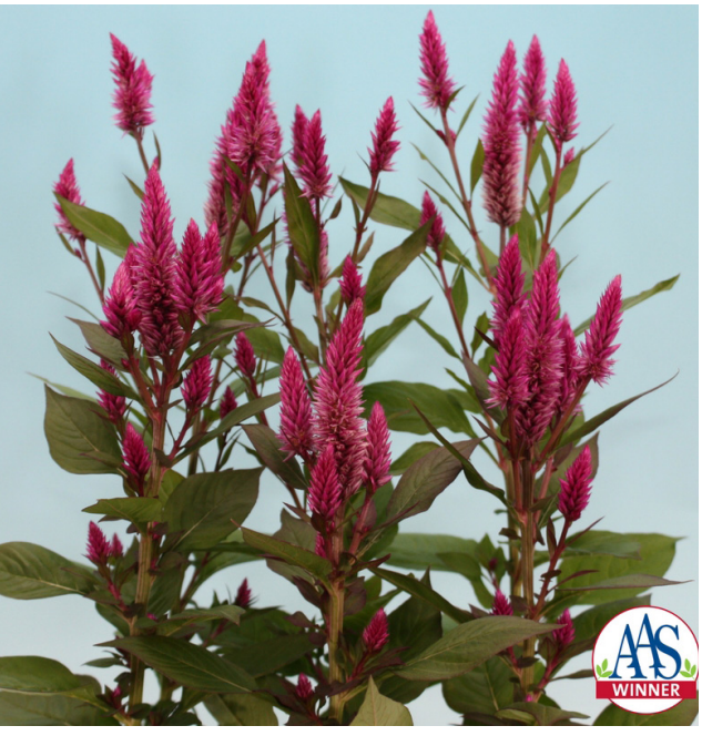
Celosia 'Asian Garden'

Calibrachoa 'Paradise Island Fuseables'® F1 (Calibrachoa hybrida). 'Fuseables'® contains several varieties in