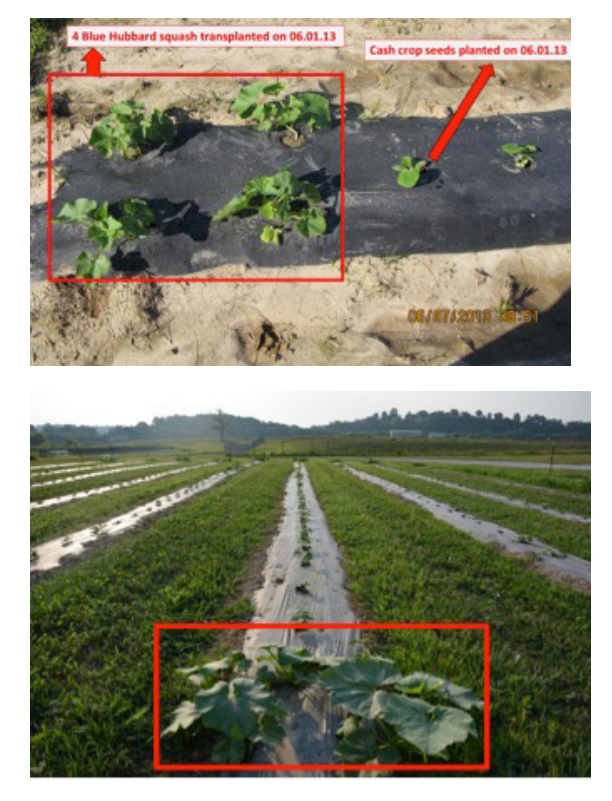
Blue Hubbard squash plants (larger plants on left) used as trap crops planted at both ends of each row.

Our research has demonstrated that for a small garden of 100 or so cucurbit plants, you can be successful at controlling cucumber beetles and squash bugs using 6-8 Blue Hubbard squash plants. For a small farm, if you grow cucurbits using plastic mulch and drip irrigation then we recommend you transplant 2-4 Blue Hubbard squash seedlings to both ends of each row.