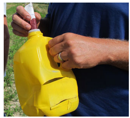
B. Lure being inserted through the mouth of a yellow-painted milk jug. (slits about ¼ inch).