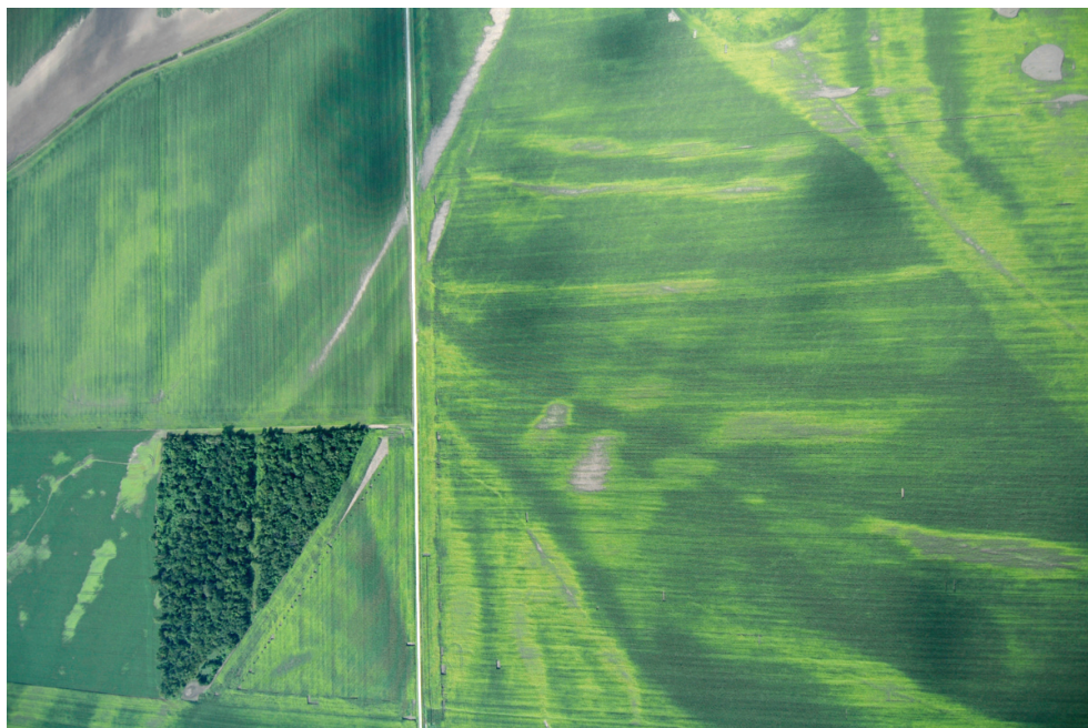
August 1 aerial photograph of a corn field in the Missouri river bottom in northwest Missouri with severe and patchy nitrogen deficiency. There are a few drowned-out areas, but nitrogen loss is limiting yield much more than stand loss. The dark green if you're seeing the photo in color) areas have sufficient nitrogen, and the light areas are highly nitrogen-deficient. The streaky, patchy mix of color in this field reflects the topography and where water runs or stands in the field. The nitrogen-deficient areas are the lower, wetter parts of the field. Applying rescue N only to the deficient areas could potentially be done using a plane or using a ground-based applicator equipped with crop color sensors.

1) Broadcast urea causes almost no yield loss due to leaf burn. In our research, we applied 150 lb N/acre as urea on corn up to four feet tall, and the yield difference between broadcast and in-row placement of urea was generally less than 4 bushels/acre. However, we made an attempt to use non-dusty urea at times when no dew