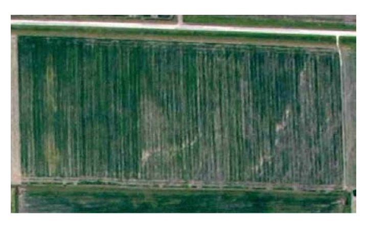
(ABOVE) Anhydrous ammonia was applied preplant to this field parallel to the corn rows. Dark streaks are about 30-feet apart which was the applicator width. This is probably a case of end knives putting out low rates.

What are the possible solutions to uneven application of dry nitrogen fertilizers? Air boom spreaders probably handle low-quality material better than spinners. You can't throw dust, but you can blow it. This may be the simplest and easiest solution, but I hear more retailers talk about moving from air boom machines back to spinners than the other way around. My thought is that it's worth it to producers to pay enough extra for air boom spreading to make it worthwhile for retailers to use these machines. Another possibility is to start more careful grading of dry fertilizer, and pay a premium for the better-quality material that can be spread evenly using a spinner machine. (This would mean that lower-quality material is cheaper, again creating an advantage for air-boom spreaders). I occasionally hear about conscientious retailers