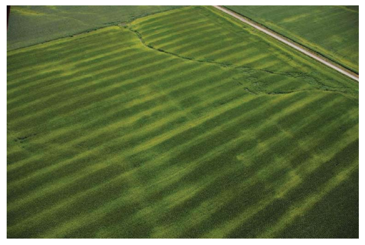
(ABOVE) Uneven nitrogen fertilizer applications with a spinner spreader are probably the cause of the streaks taken in this photo late in August 2008.

In the last issue, I wrote about widespread loss of nitrogen fertilizer from corn fields in 2008 (http://ppp.missouri.edu/ newsletters/ipcm/archives/v19n1/a2.pdf). Something that always strikes me when I am taking aerial photos in areas that have had excessive rainfall and nitrogen loss is how many fields have obvious streaks of light and dark green. I would say that in 2/3 of all fields where I see severe N stress I also see at least some streaking.