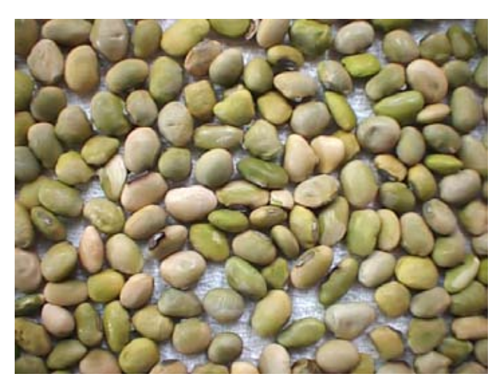
Figure 1. Soybean Seeds from prematurely killed plants.

Frost damaged soybean grain should store almost as easily as normal soybean grain, although aeration is strongly recommended. Seed moisture content will be higher than expected because seeds killed prematurely will not dry as quickly as seeds that mature normally. The usual precautions of foreign material and damaged seed coats apply to all stored soybeans. Plants killed by frost will retain leaves and stems may remain green. This can add moisture to grain or make grain difficult to separate from other plant parts. Prematurely killed soybean seeds will shrink to smaller than normal size and the shape