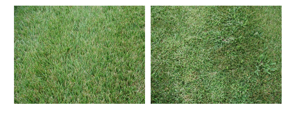
Figure 1. Tall fescue mowed at 3.5 inches (left) and 1.5 inches (right) - notice large amounts of crabgrass in the photo to the right.