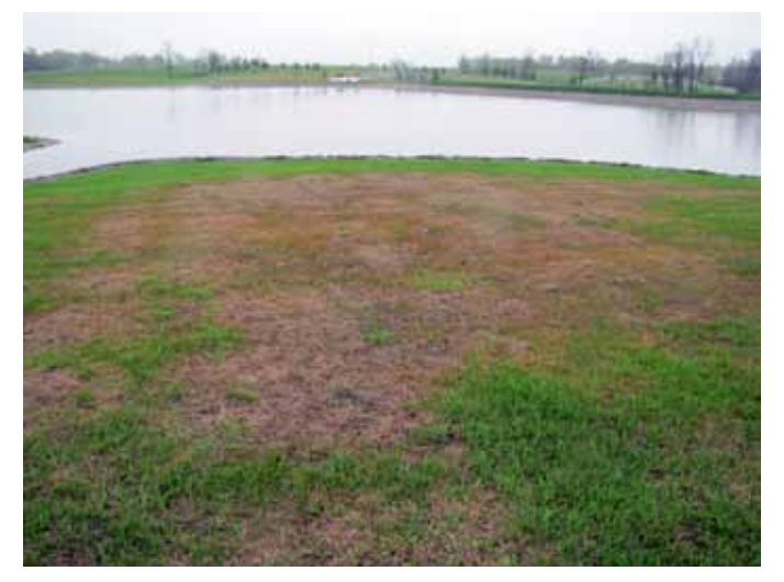
Continued on page 34

The greenbug is an aphid or sometimes referred to as a "plant louse." They have a piercing, sucking mouth-part that removes sap from turfgrasses. When feeding, they inject saliva that is toxic to plant tissue causing the tissue around the feeding site to die. Damaged begins as chlorotic (yellowing) lesions that eventually turn brown. With the loss of sap and the translocation of toxins throughout the plant, the whole plant, including roots, will die. Heavy infestations can amount to 2000 to 3000 aphids per square foot. If left untreated, damaged sites will require re-seeding or re-sodding.