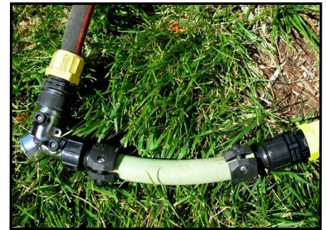
Fig 1. Gender Bender and Y adaptor to improve uniformity of delivery of a soaker hose.

into cracks in the soil. Keep the hose running during the day, moving it around to the trees showing the most severe drought stress symptoms. Consider using a timer so you will not forget to turn the water off when you are not tending the hose.