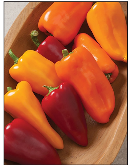
Sweet pepper aura and glow.

When establishing peppers in the garden, it is best to use transplants rather than seeds. Pepper seeds are slow to germinate in cool soil. Space plants 12 to 18 inches apart within rows separated by a minimum of 24 inches. Popular varieties of sweet pepper for the home garden include ‘Revolution’, ‘King Arthur’, ‘Yolo Wonder’, ‘Big Bertha’ and ‘Aristotle’.