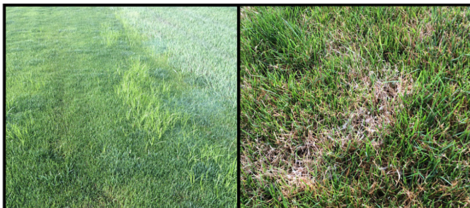
Aside from just keeping up with mowing between rain events, increased weed (left) and disease (right) pressure has resulted from the wet weather in May - July 2015.

The Missouri turfgrass industry is being adversely affected by the persistent wet weather, but not nearly to the extent as the annually planted row crop industry in the state. As we experience what could be the wettest May – July period in Missouri history, below are a few bullet points that point out some of the hardships this current pattern has brought to the turfgrass industry.