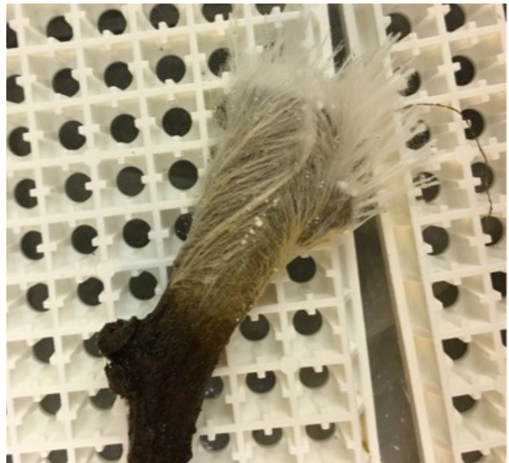
Fig. 3. Typical diagnostic feature, the fan shaped mycelia of southern blight on tomatoes caused by Sclerotium rolfsii .