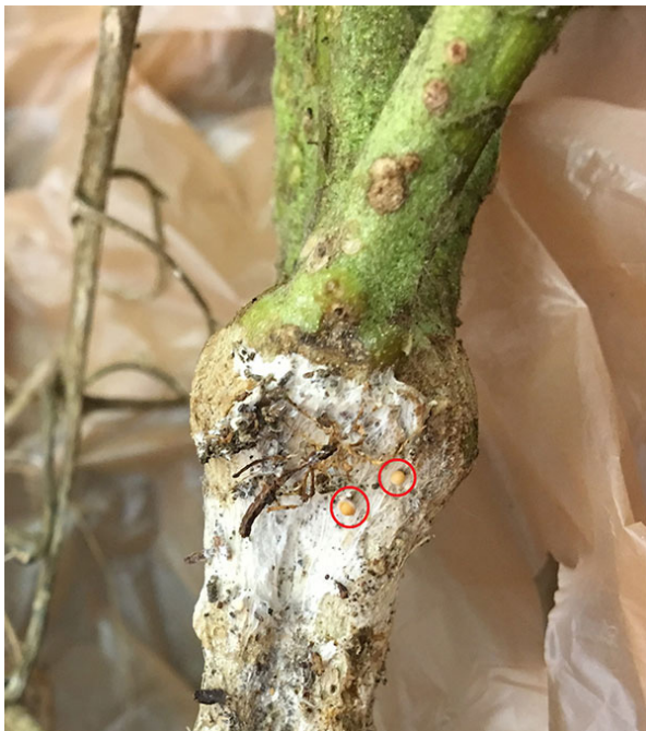
Fig. 2. Typical signs of southern blight disease on tomatoes caused by Sclerotium rolfsii shown by the white mycelium and tan to brown colored sclerotia (red circled).