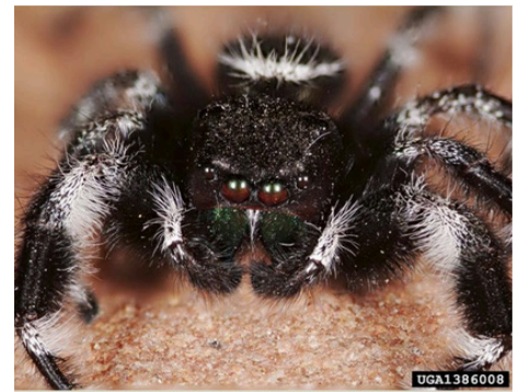
Daring jumping spider ( Phidippus audax ).