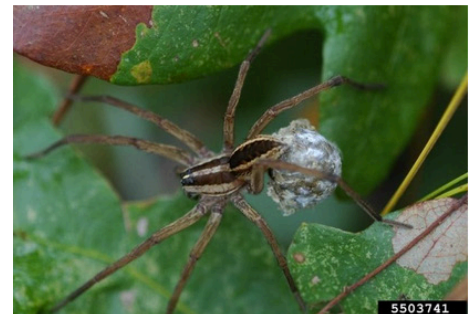
Wolf spider ( Rabidosa rabida).