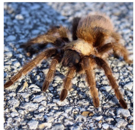
The Missouri Tarantula ( Aphonopelma hentzi ), also known as Texas Brown, is the only tarantula species inhabiting Missouri.

Spiders from the “wolf” family (Lycosidae) received their name because they are frequently seen prowling the ground in search of bugs to eat. They can attain sizable leg spans of 4 inches (or more) and are often mistaken for tarantulas.