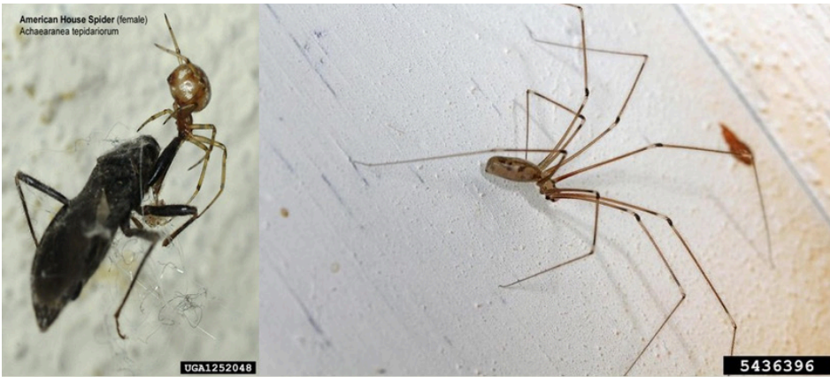
LEFT American house spider ( Parasteatoda tepidariorum , formerly known as Achaearanea tepidariorum ). Photo credit: Joseph Berger, Bugwood.org. RIGHT Cellar spiders ( Pholcus spp). Photo credit: Joseph Berger, Bugwood.org.