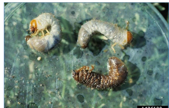
Japanese beetle larvae killed by Heterorhabditis bacteriophora next to two healthy larvae.

One naturally occurring bacterium that is commercially available is called Milky Spore®, which is an option for controlling grubs in the soil that damage the lawn. When spores of Milky Spore are ingested by Japanese beetle grubs, they die and in the process they release billions of new spores into the surrounding soil. One example of a commercially-available formulation of Milky Spore is produced by St. Gabriel Organics. Cost to treat 2,400 square feet is about $30. This product is most effective when applied in early- or mid-August, when the grubs are actively feeding. The soil must be above 65 degrees F. It works best to apply it just before rainfall, or consider watering in lightly after application to soak into soil. The number of applications recommended by the label should be considered, applying Spring, Summer, and Fall for two consecutive years (six total). While this significantly increases the expense, it is claimed to give faster control, for up to 20 years.