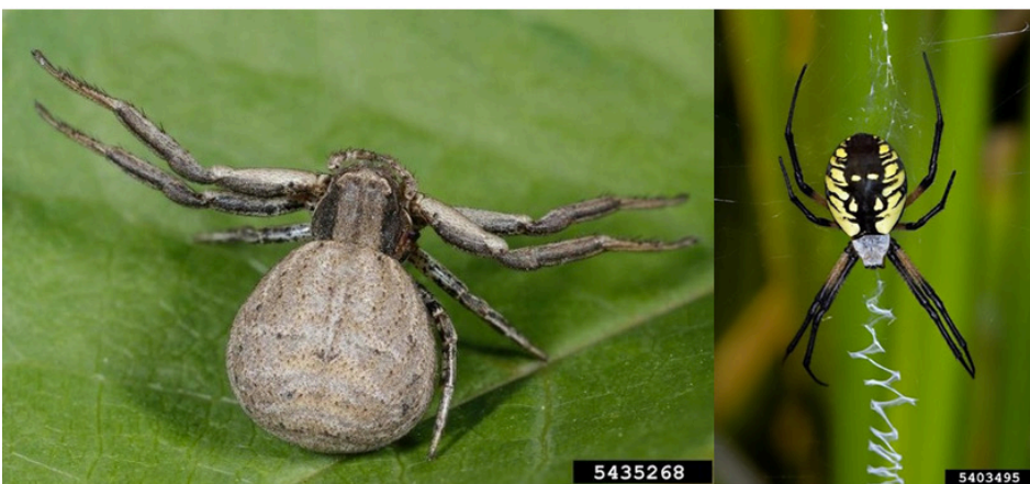
LEFT Ground crab spiders ( Xysticus spp.) RIGHT Yellow garden spider ( Argiope aurantia ).