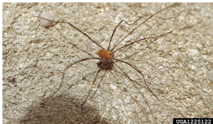
Harvestmen ( Leiobunum spp.)

Common species of spiders that ambush their prey include jumping spiders, wolf-spiders, and the Missouri tarantula. Adult jumping spiders are typically black in color and 1 inch (2.54 cm) in length. They have green pedipalps and a white patterned abdomen that resembles a face. As the name implies, they can “jump” (up to 50 times their body length!).