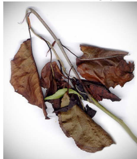
Figure 1. A terminal shoot infected with fire blight has the typical "shepherd's crook" symptom with dead leaves remaining on twigs.

moderately susceptible apple cultivars and rootstocks are planted, fire blight control will be necessary when conditions are optimal for disease development. For more information regarding fire blight control options, refer to MU Extension Guide G6020.