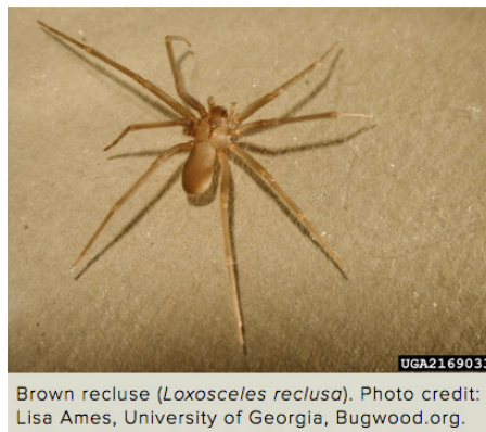
Brown recluse ( Loxosceles reclusa).

Loxosceles reclusa is commonly found throughout Missouri. It’s called the “brown recluse” for obvious reasons and most easily recognized by the distinct violin shaped marking on its carapace. Although this spider has received a lot of negative publicity for having necrotic venom that “rots flesh”—bites from this species are very rare. Only 10% of brown recluse bites are medically significant. About 90% heal on their own.