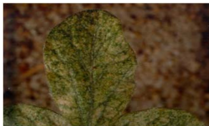
Leaf stippling or 'flecking' is a typical symptom of spider mite problems

New in the 2011 Midwest Vegetable Production Guide is Hero® (FMC Agricultural Products), a broad-spectrum insecticide that has been labeled in Missouri for use in vegetables (tomatoes, succulent peas and beans, eggplant, peppers (bell and non-bell), head lettuce, head and stem brassicas, root and tuber vegetables), nuts and vines. The active ingredients for Hero® are the pyrethroids zeta-cypermethrin (the same active ingredient as in Mustang) and bifenthrin (the same active ingredient as in Capture). Hero® is a new generation insecticide that provides fast knockdown and longer-last control of many insect pests and several types of mites. Mites are often problematic during dry and hot periods ; Hero® can be considered as a control option. [Other miticide choices that are effective on spider mites, but do not control other insect pests, are abamectin (Agri-Mek; Epi-Mek), bifenazate (Acramite), spiromesifen (Oberon) and wettable sulfur.]