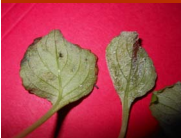
Photo below Closer view of the white fuzz made up of sporangia and sporangio-phores of P. obducens , the downy mildew pathogen.

An elderly country philosopher once remarked, “Don’t worry, no matter how bad things seem to be, they can always get worse”. Such is the case with many things in life, including our constant battle to manage plant pests in our production greenhouses. Every time we feel fairly confident in our management regimen, a new pest comes our way to challenge our ability as growers. For 2013 and beyond, that diseases for bedding plant growers might be impatiens downy mildew.