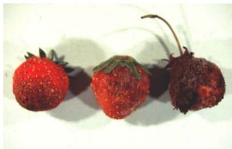
Typical symptoms of gray mold rot on strawberry fruit.