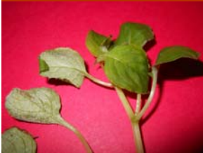
Photo Above Terminal leaves of an Impatiens plant infected with Plasmopara obducens . Note slightly chlorotic and curled appearance with white fuzz on the underside. Photo courtesy of T. Schubert

Photo below Closer view of the white fuzz made up of sporangia and sporangio-phores of P. obducens , the downy mildew pathogen. Photo courtesy of T. Schubert