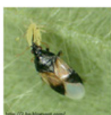
Minute pirate bug