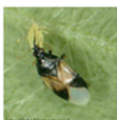
Minute pirate bug