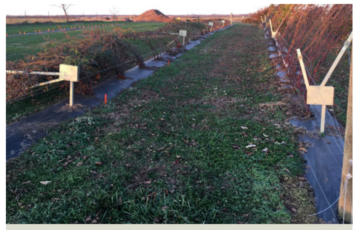
RCA trellis, showing the winter/spring position (left) and the summer/fall fruiting position

The planting consists of 3 rows that are 12 feet apart, oriented east to west. Plants are planted 5 feet apart in plots of 3 plants per cultivar, with 3 plots per cultivar in the planting. The plants are on raised beds that are 36" wide and 8" high. We covered the beds with woven landscape fabric, and placed a single 18mm dripline per row, with 18" emitter spacing. We followed standard cultural practices with regard to preplant soil testing and soil modification, planting establishment, pest management, and weed management between rows (which were in sod). The planting was fertigated weekly from April to September, for an equivalent of 80 total lbs/acre of nitrogen per growing season.