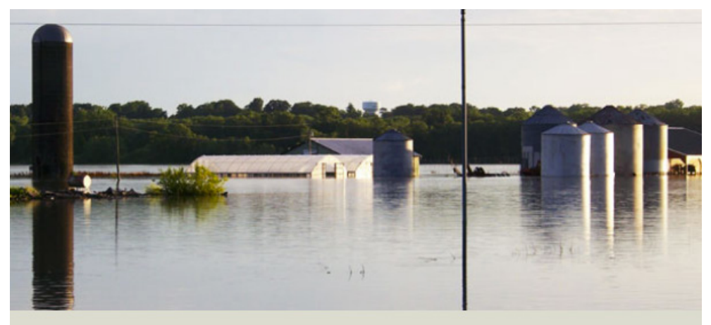
High tunnel flooded just outside of Jefferson City in the Missouri River bottoms.

Missouri's average rainfall in May was the greatest since 1895, when records were 1st kept. MU Extension climatologist Pat Guinan said it was 200% of normal. Not only the amount of rain was difficult, but the longevity of it plagued normal activities such as putting up hay and planting row crops, the latter being at delayed rates not seen in years. Planting progress in June should restore the planted acres, but the yields are likely to be reduced. This coupled with low commodity prices and catastrophic flooding has many concerned about the health of the overall Midwest farm economy.