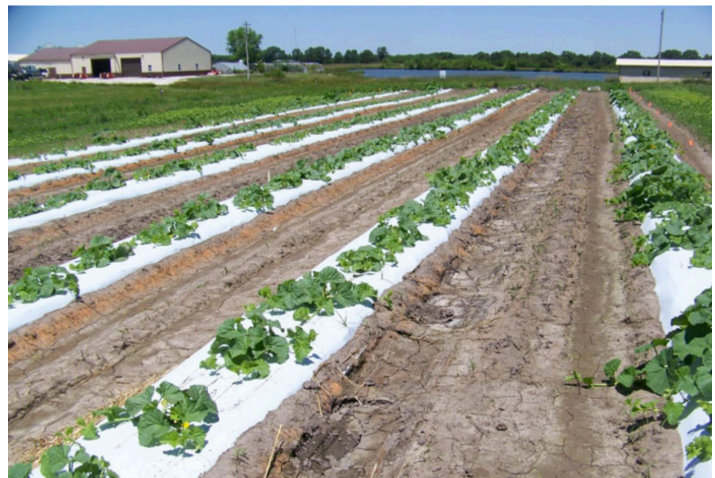
Melon plot on June 11, which was 25 days after the beds were formed and 22 days after preemergent herbicides were applied. Some weeds were becoming noticeable.

A major limitation to using preemergent herbicides is their effect on subsequent crops. Typically several months up to a year or more may be required to elapse before sensitive crops are planted. Thus, if a grower wants to replant a mixture of vegetable crops back to the same area of land, this could be a limit use of preemergent herbicides. It is up to the grower to become familiar with the rotational crop restrictions, which can be significant. An example is with Sandea, which should not be followed with Cole crops for 15 to 18 months.