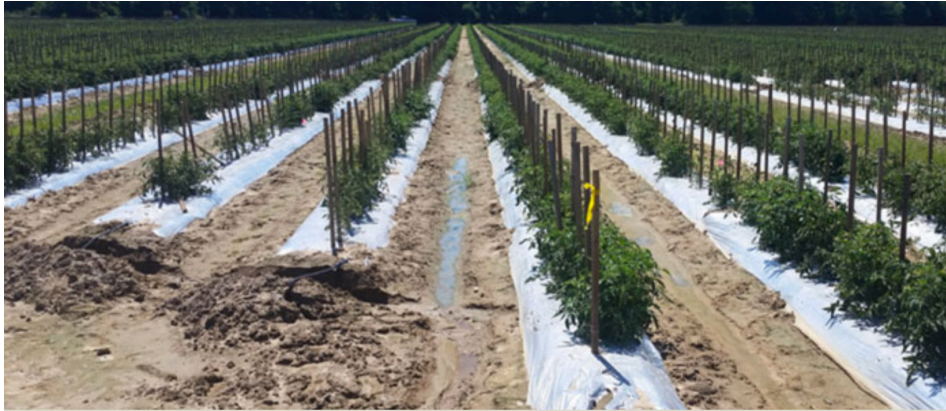
Figure 3 Tomato grown on conventional beds (three 6-inch tall beds on the left) and on tall beds (three 12-inch tall beds on the right) subjected to excess soil moisture. Difference in growth is evident.

Tall planting beds (12 to 15 inches) are known to reduce the detrimental effects of excess moisture and/or flooding events in specialty crops. In most cases, tall beds improve drainage decreasing long periods of root zone saturation and maintaining good air exchange for root respiration and plant growth. Furthermore, soil conditions in tall beds are less prone to soil-borne diseases. Figure 3 shows a study with tomatoes where superior plant growth is evident in tall (12 inches) compact beds under excess soil moisture in comparison to conventional (6 inches) beds. This difference in growth was reflected in similar differences in yield between the two bed heights.