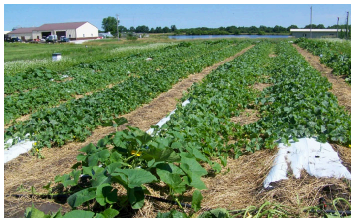
Melon plot at end of June. A second round of preemergent herbicides (and a burndown) was applied about 2 weeks prior (the day of the photo above). A light layer of straw was then applied, mostly to facilitate harvesting during rainy conditions, but it likely suppressed some weed growth.