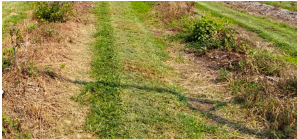
Figure 2 Blueberries plant losses to Phytophthora spp. promoted by excess soil moisture and shallow beds.