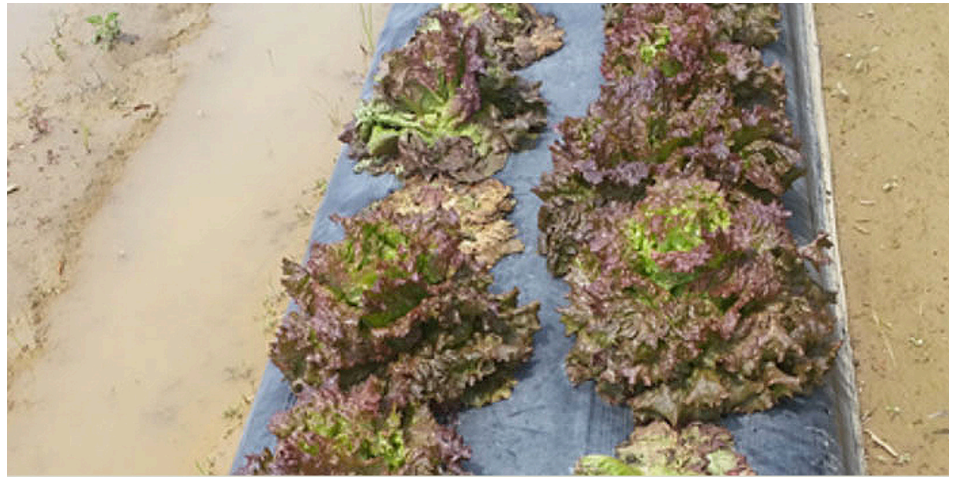
Figure 1 Rotting lettuces after 10 days of standing water and saturated soil.

A large proportion of soil planted to fruits and vegetables in Missouri are silty clay to clay loam with relative poor drainage in comparison to deep sandy soil in other specialty crops growing areas. Excess soil moisture is conducive to soil saturation, that promote root asphyxia and rotting (damping off, root rots, etc.) where pathogens such as Pythium spp, Fusarium spp, Phytophthora spp, and others can cause serious losses (Figs. 1 and 2). Planting in shallow beds with excess moisture and poor drainage due to the soil type may exacerbate the problem since plant may not die, but they will perform poorly.