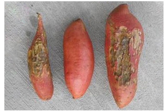
Figure 1 Sweet potato storage roots with sunken leathery scars from skinning because of inappropriate healing conditions.

Variety, location and management influence sweet potato yield and proportion of root sizes. With acceptable management practices, yield may range from 150 to 350 bushels (50lb) per acre of U.S. No.1 roots, the preferred size for fresh market ( table 1 ). A 50% to 60% of the harvest should correspond to U.S.No.1, so total harvest could reach 300 to 700 bushels per acre. In general, growers separate and classify the rest into small roots as canners (diameter between 1-1/2 and 2 inches) and large ones as jumbos (diameter above 3-1/2 inches). Under exceptionally good conditions and irrigation, total yields of 800 to 1,000 bushels per acre are possible in southern states ( Figure 4 ).