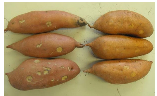
Figure 3 Wound healing and generation of new skin: sunken dry wound scars (left) and new skin generated when curing immediately after harvest (right).