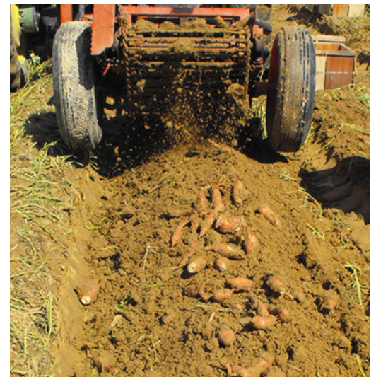
Figure 2 Chain digger dropping sweetpotato storage roots after sieving the soil through the chain.