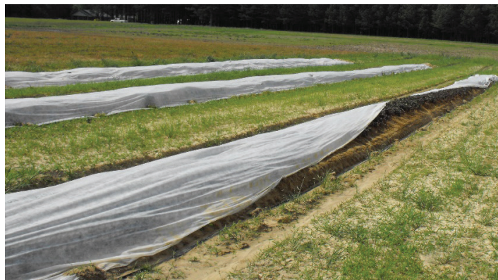
Figure 3. Bed covered with floating row cover after plastic mulch has been removed.