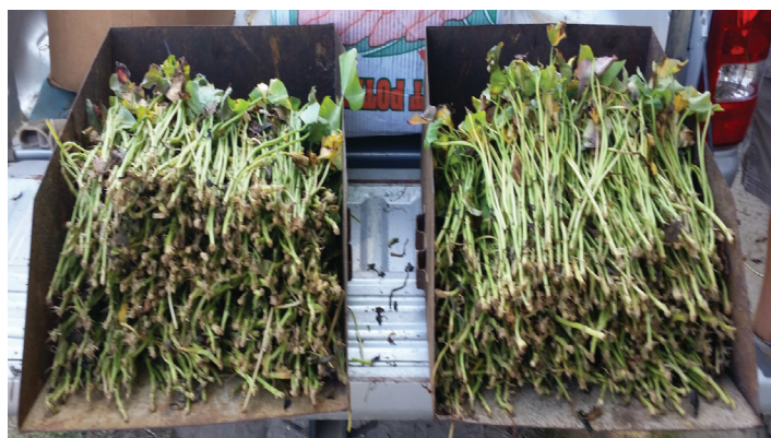
Figure 4. Cut sweet potato slips for field planting.