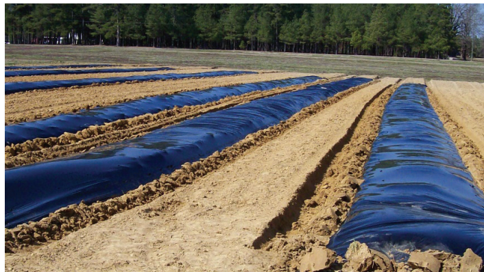
Figure 2. Beds covered with black plastic mulch to warm up the soil.