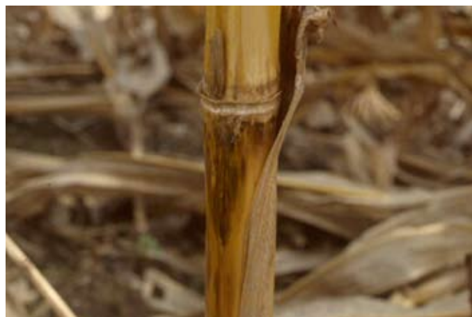
Figure 3. Diplodia stalk rot

Diplodia ear rot is listed on some fungicide labels but timing of application