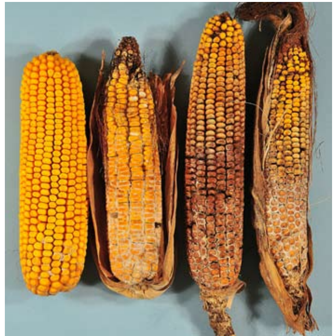
Figure 2. Four ears with ranging symptoms of Diplodia ear rot of corn.

The most characteristic symptom of Diplodia ear rot is seen when the husks are peeled back revealing a dense white to grayish-white mold growth matted between the husks and the ear and between the rows of kernels. Symptoms often start at the base of the ear. Severely infected ears may be shrunken, light weight and completely covered with grayish-white to grayish-brown mold growth. These ears may be completely rotted. Figure 2 shows four ears with symptoms ranging from a very light infection on the ear on the left to a completely rotted ear on the right.